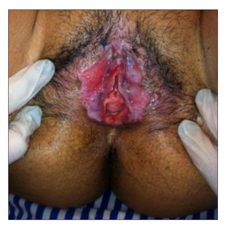
Figure 1 – Patient's genital ulcer at first appointment in Hospital Universitário Antônio Pedro.

The granuloma inguinale or Donovanosis begins with the uprising of a subcutaneous nodulation, generally unilateral and painless, whose erosion produces well defined flat edge or hypertrophic ulceration with a granular basis of bright red appearance and easy bleeding, evolving to vegetative but painless injury, which may be single or multiple. It is not associated with adenitis, and the presence of Donovan corpuscles in the biopsy material confirms the diagnosis<sup>(8)</sup>.