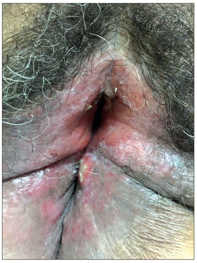
Figure 4 – Genital lesions: 30th day of antiviral treatment.