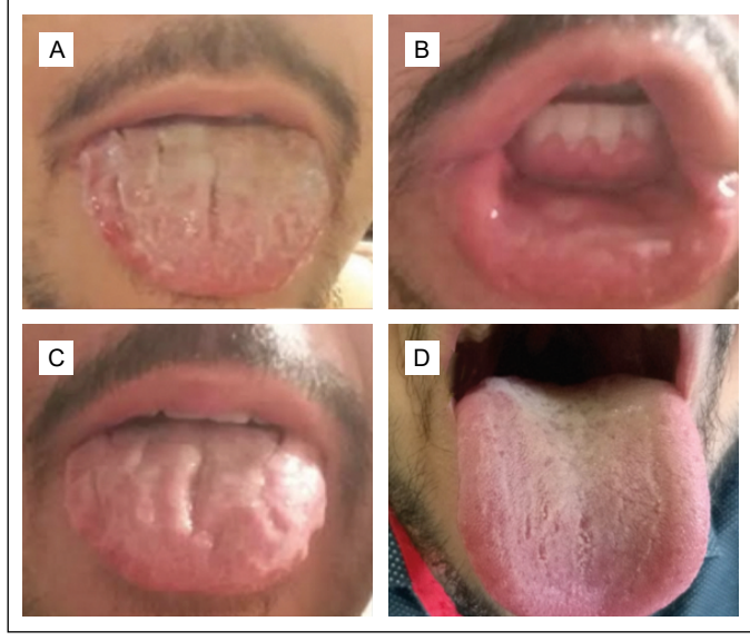
Figure 2 – (A), (B) and (C) Irregular white plaques in back of tongue and lower lip mucosa; (D) total regression of the lesion.

Female patient, 49 years of age, married for five years (was separated from her husband for a year and reconciled one year before