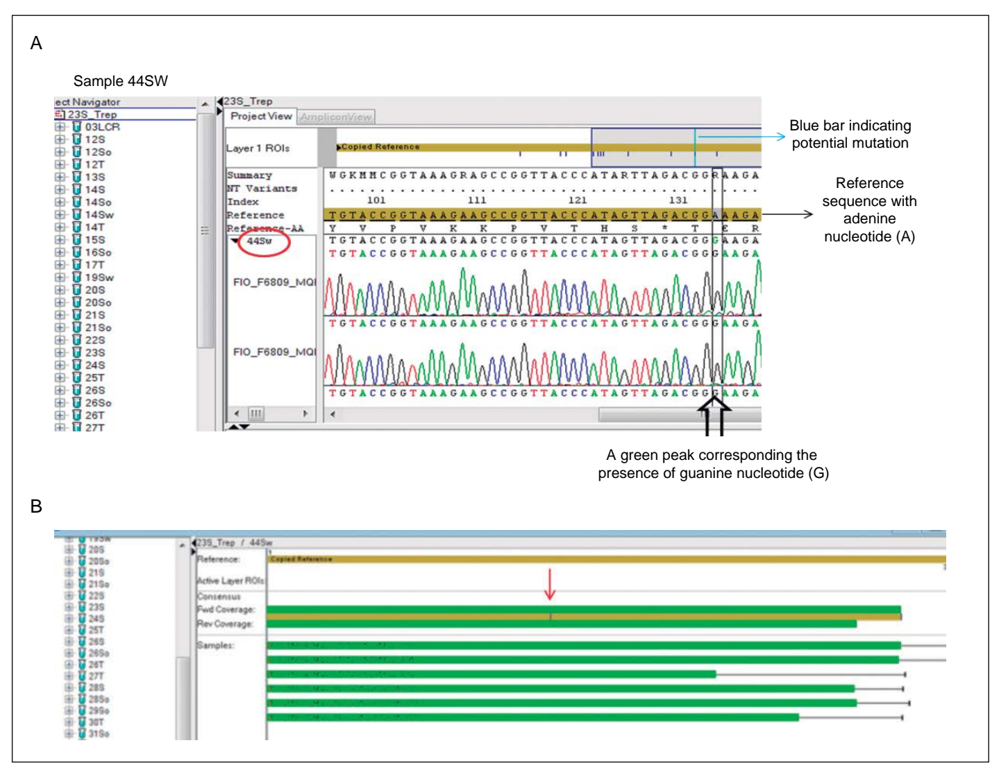
Figure 3 – Samples of the patient with mutation A2058G. (A) Visualization of the chromatogram within the SeqScape<sup>®</sup> program in which a nucleotide other than the reference sequence was found. (B) Image showing the sequences obtained from each initiator, as well as the region of exploitation of each of them (green). In this sample, a nucleotide (red arrow) distinct from the reference sequence was identified.