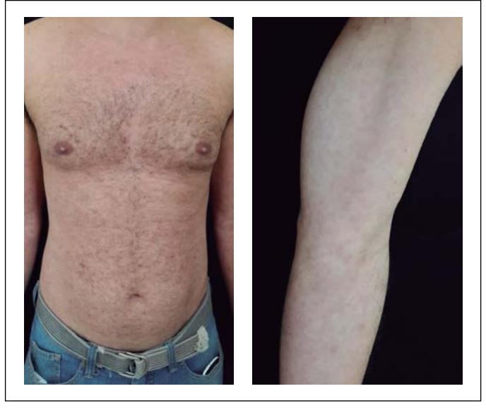
Figure 1 – Case patient presenting disseminated skin rash (syphilitic roseola).

This study was approved by the Ethics Research Committee of Fiocruz, Brazil (Certificate of Presentation for Ethical Consideration — CAAE — no. 58752716.5.0000.5248).