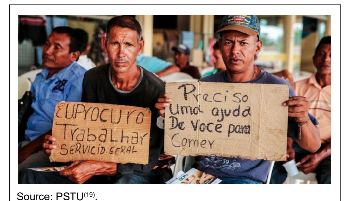
Figure 2 – Venezuelan immigrants in search of work in the Brazilian labor market.

One of the Brazilian federal government's actions to deal with this situation was the creation of the Federal Emergency Assistance Committee in 2018, which, at the time, decreed a state of social emergency and instituted actions aimed at assisting and welcoming Venezuelans. Several governmental and non-governmental agencies, together with UNHCR humanitarian aid, have been striving